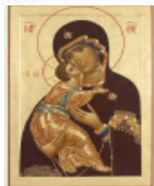
Theotokos of Vladimir